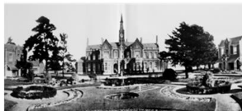
Melbourne Orphanage, Brighton