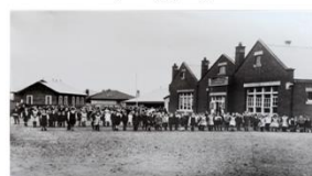
Brighton Beach State School circa 1910