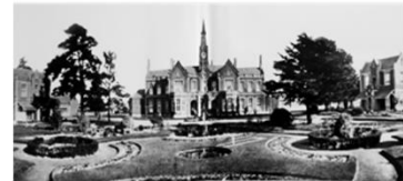
Melbourne Orphanage, Brighton