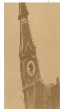
Demolition of orphanage administration tower