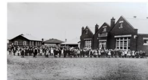
Brighton Beach State School circa 1910