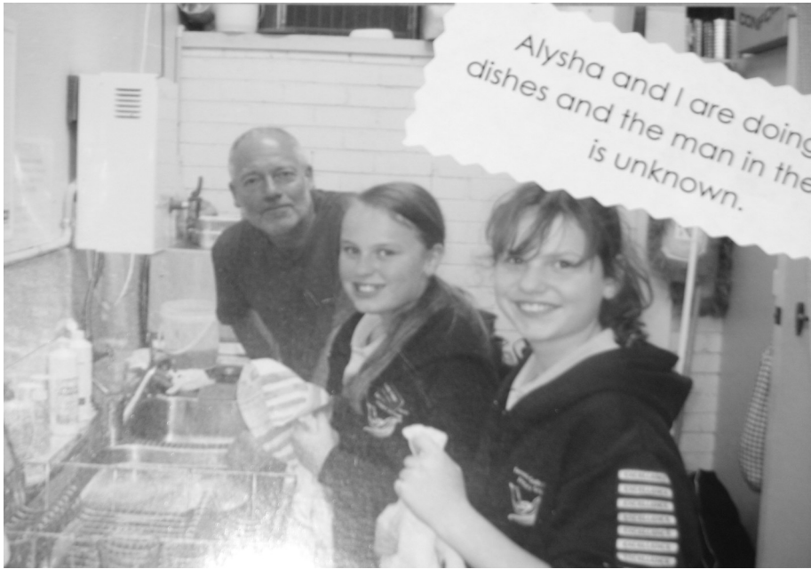
Ferntree Gully North Primary School Students—Community Kitchen