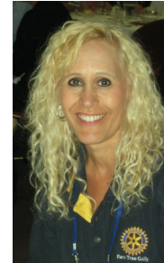
Cass Bench 2013