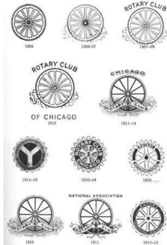
Changes in design of Rotary Wheel