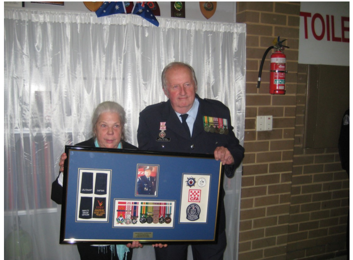
CFA Ferntree Gully Awards Night