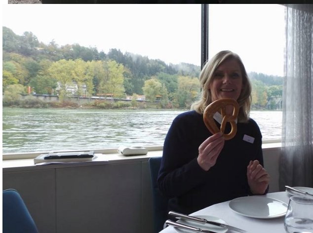
Traditional Bavarian Pretzel with the Danube in the background

We've spent a wonderful morning in Würzburg. Cannot begin to describe in words what we have seen. As someone who has always loved, studied and appreciated art I feel very blessed by my experiences today. The Bishops Princes residence had to be seen to be believed and to be able to view the amazing frescos and stucco work that dated back to the 17th century, still immaculately preserved, cannot be described. I have bought a heap of postcards as you were unable to take photos of this Unesco heritage listed property and its priceless art works. Whilst enjoying coffee and wine in the glorious sunshine we met up with the president of a Rotary club in Germany. We have had a long chat, exchanged information and plan to keep in touch. Back on the ship now sailing for Bamberg.