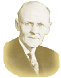
Paul P. Harris, Founder of Rotary 23 February 1905

Here's to success, real success, your success, my success, the world's success; and here's to the foundation of success, the practicalized scientized, sterilized, vitalized foundation of your success, my success, the world's success - acquaintance, the dynamics and harmonies of Rotary."