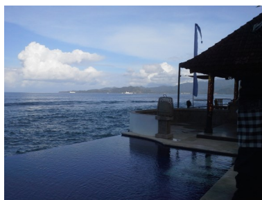
The Resort—Bali Santi, Candidasa