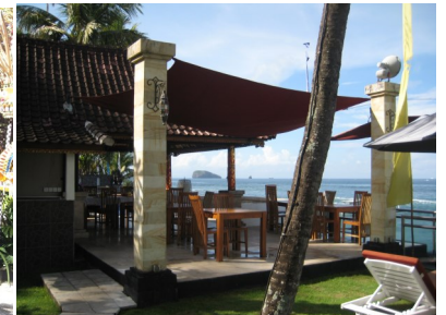
Above: Our dining area