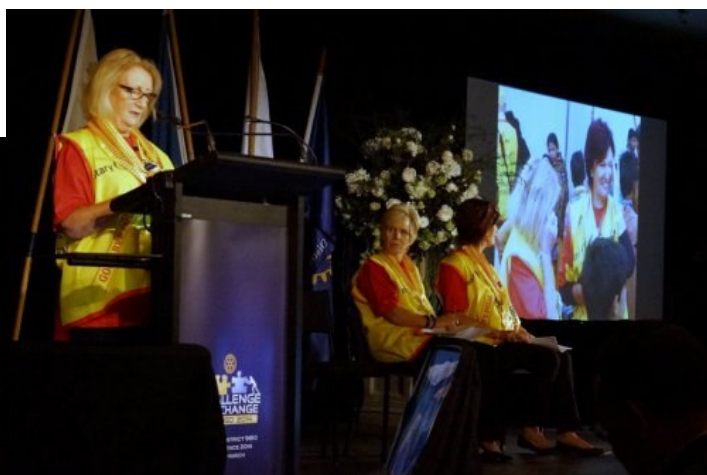
The Eradicate Polio team who went to India a second time