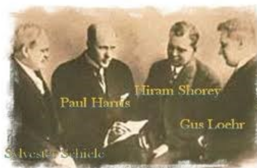
The start of Rotary—the world owes these men a great deal!

- See more at: http://www.alexmakin.com.au/2014/02/marketing-is-an-investment-make-sure-it-delivers-results/ #sthash.OmZmKiho.dpuf