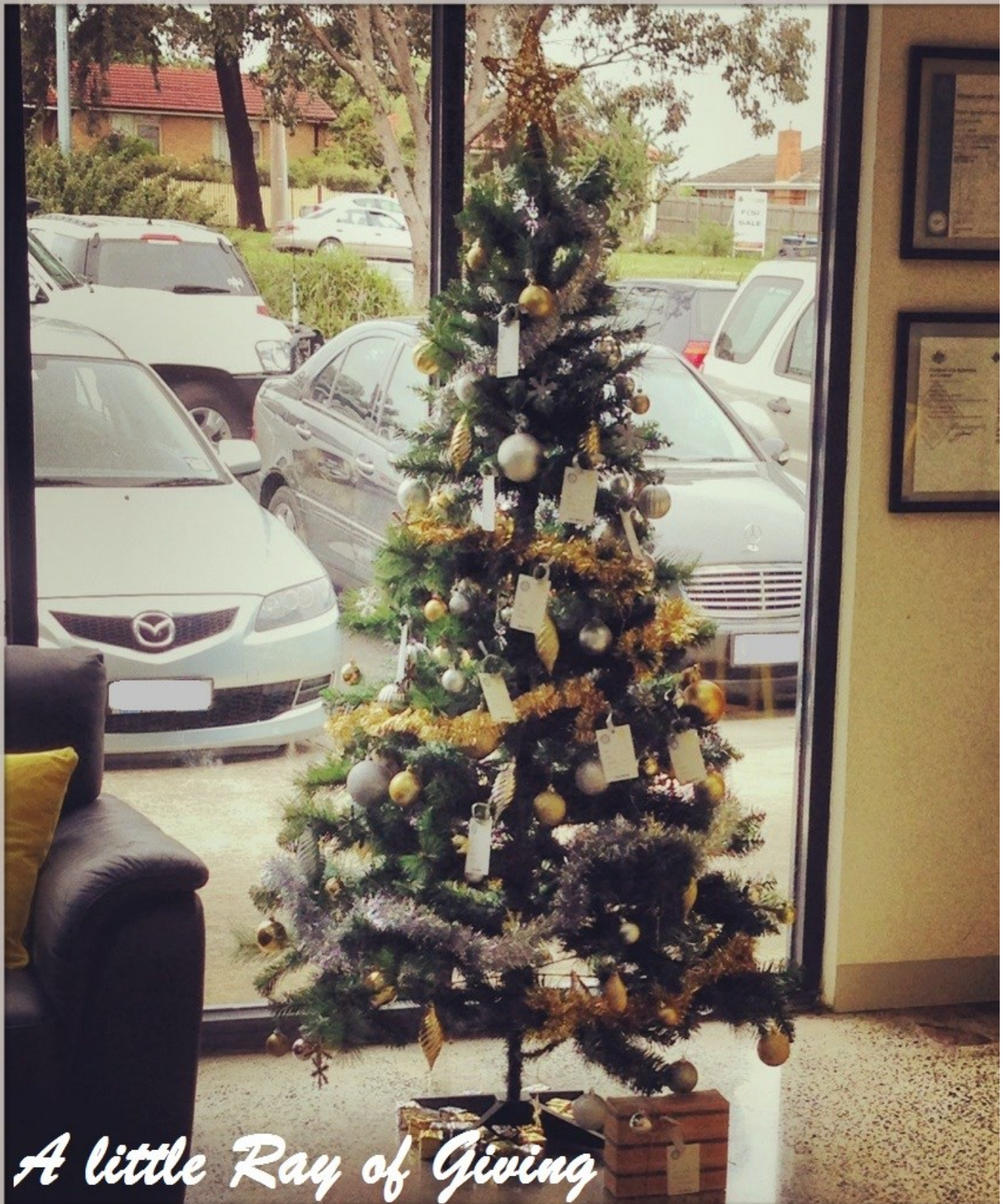
The Christmas Tree Located in the window Of Ray White Real Estate, FTG