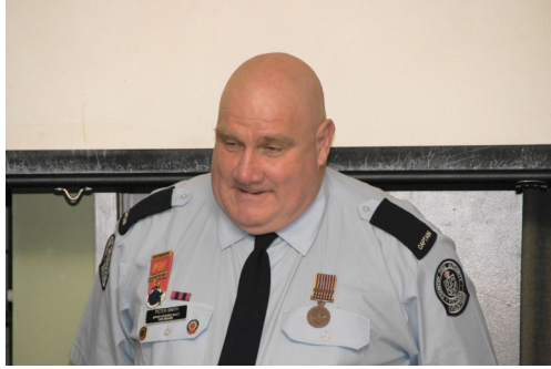
MORE CHANGEOVER PICTURES